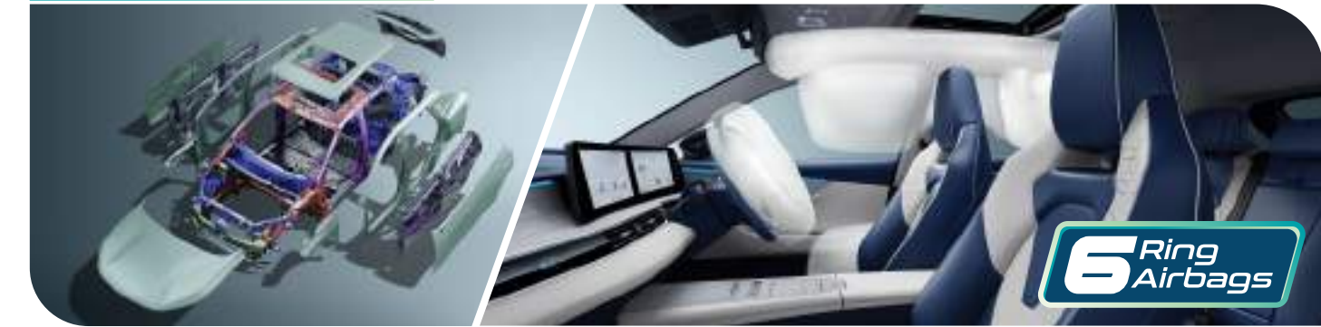
78% High-Strength Steel Body with Collision Dampening Point