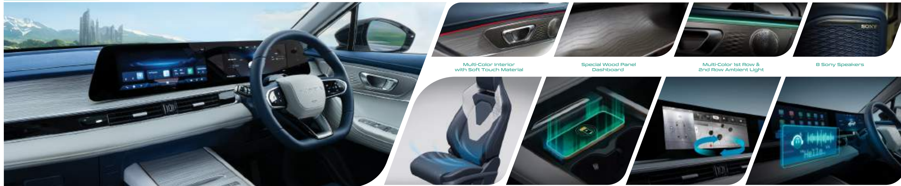
Futuristic Cabin with 24,6 inch Super Large Curved Screen