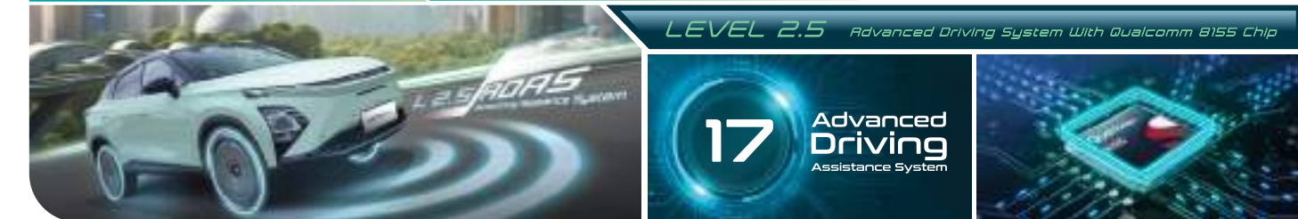
LEVEL 2.5 Advanced Driving System With Qualcomm B155 Chip