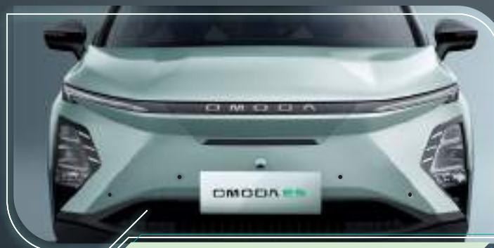
X Future Tech Front