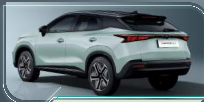
Light & Shadow Streamline Body