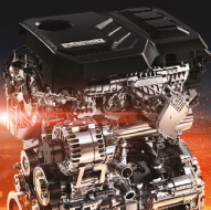
2.0 Turbo Gasoline Direct Injection